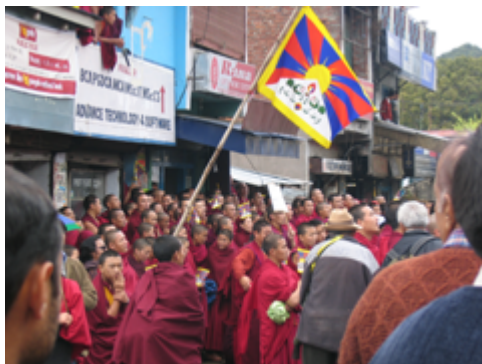
photo at right of children from TCV with banner and Tibetan flags.) In lower Dharamsala the hundreds of marchers assembled in an open square and a couple of speeches were